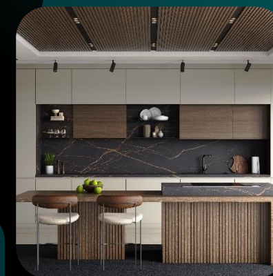
Furniture component parts