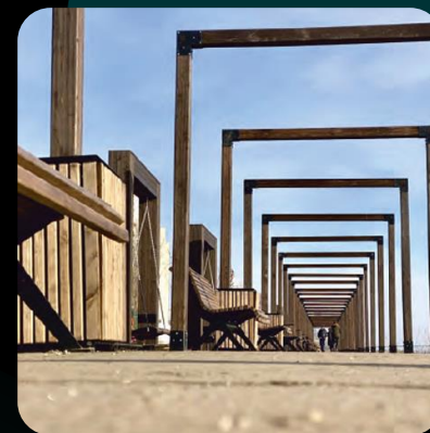
Paintwork materials and adhesives