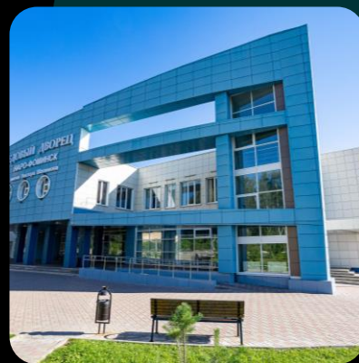
Package solutions for aluminium facades